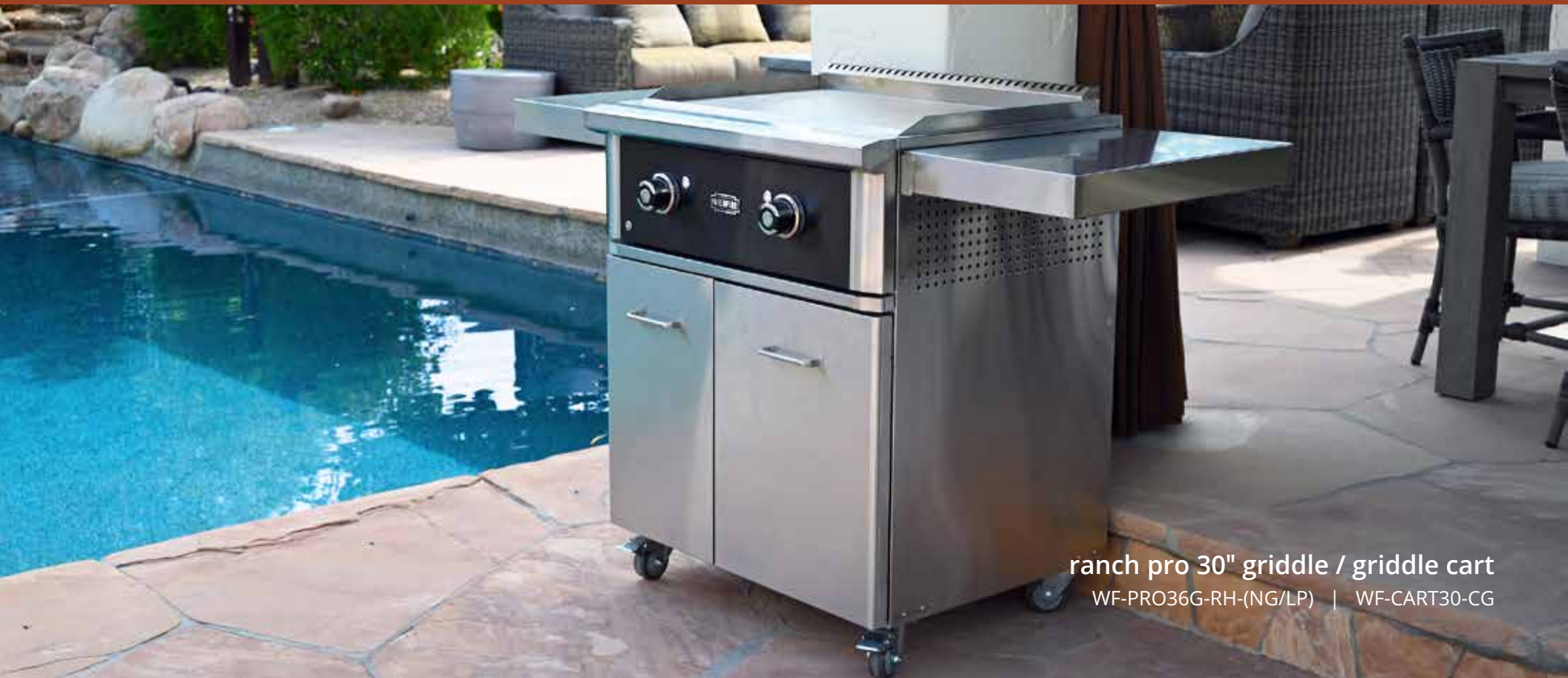
ranch pro 30" griddle / griddle cart WF-PRO36G-RH-(NG/LP) | WF-CART30-CG

Effortlessly smooth cooking from breakfast to dinner Stainless steel surface griddle is perfect for cooking griddle type foods.