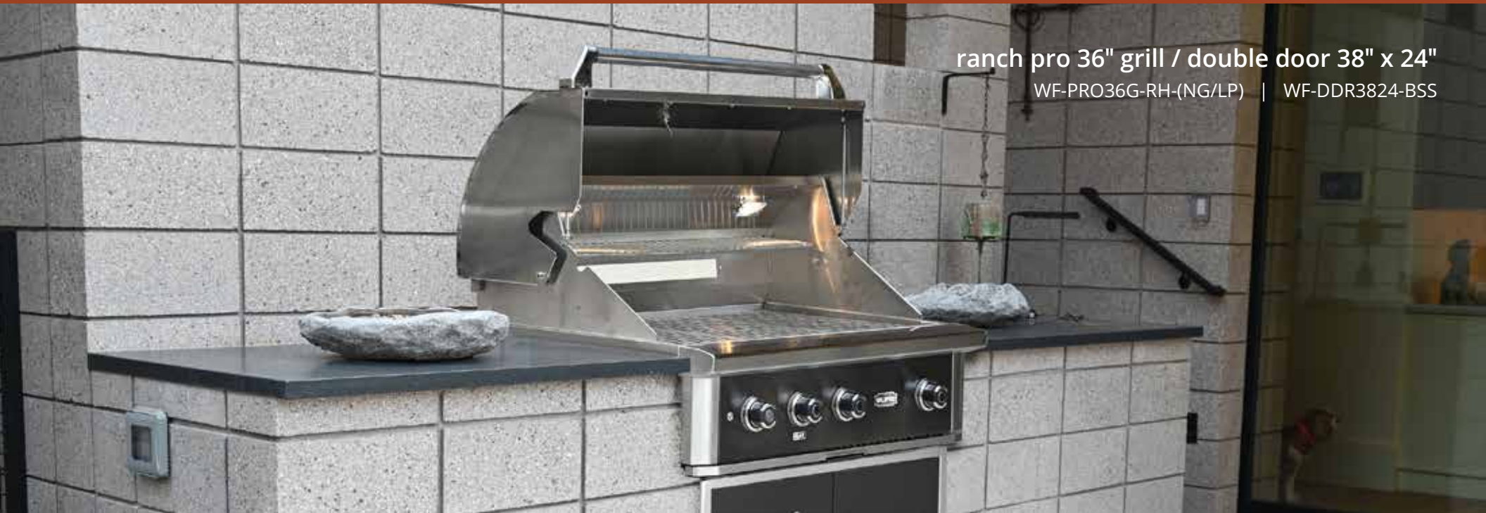
ranch pro 36" grill / double door 38" x 24" WF-PRO36G-RH-(NG/LP) | WF-DDR3824-BSS

Delivering a modern outdoor cooking and grilling experience is at the heart of what we do. Our team of BBQ experts, mechanical engineers and industrial designers crafted a collection that brings the comfort of indoor cooking to the outdoors for a more rugged experience.