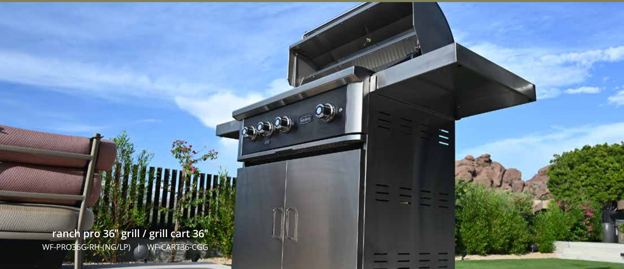
ranch pro 36" grill / grill cart 36" WF-PRO36G-RH-(NG/LP) | WF-CART36-CGG

Looking for the perfect spot to grill? Our grill and griddle carts make it easy for you to set up anywhere. Mobile? Yes. But our carts pack the same top-quality construction, function and looks as our island grills.