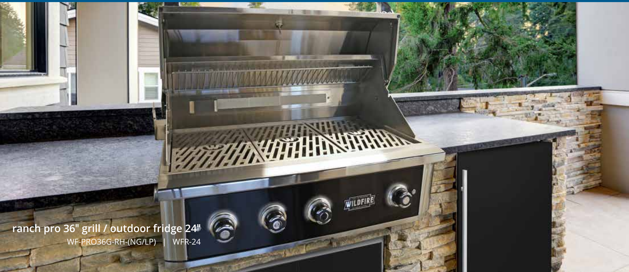
ranch pro 36" grill / outdoor fridge 24"

Reach for a cold drink or store fresh food; our fridge and ice chest add function and style to your outdoor kitchen..