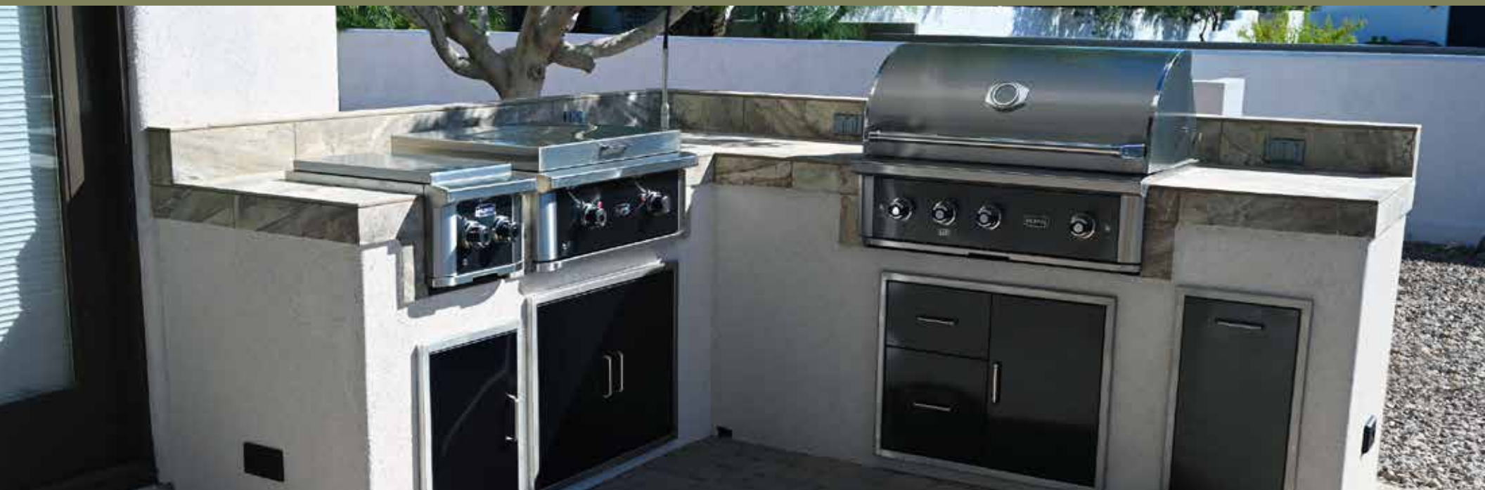
ranch pro 36" grill WF-PRO36G-RH-(NG/LP) ranch pro griddle 30" WF-PRO30GRD-RH-(NG/LP)

You can never have too much storage. Keep your favorite grilling tools close at hand with your choice of drawers and doors in our signature Black 304 Stainless Steel finish.