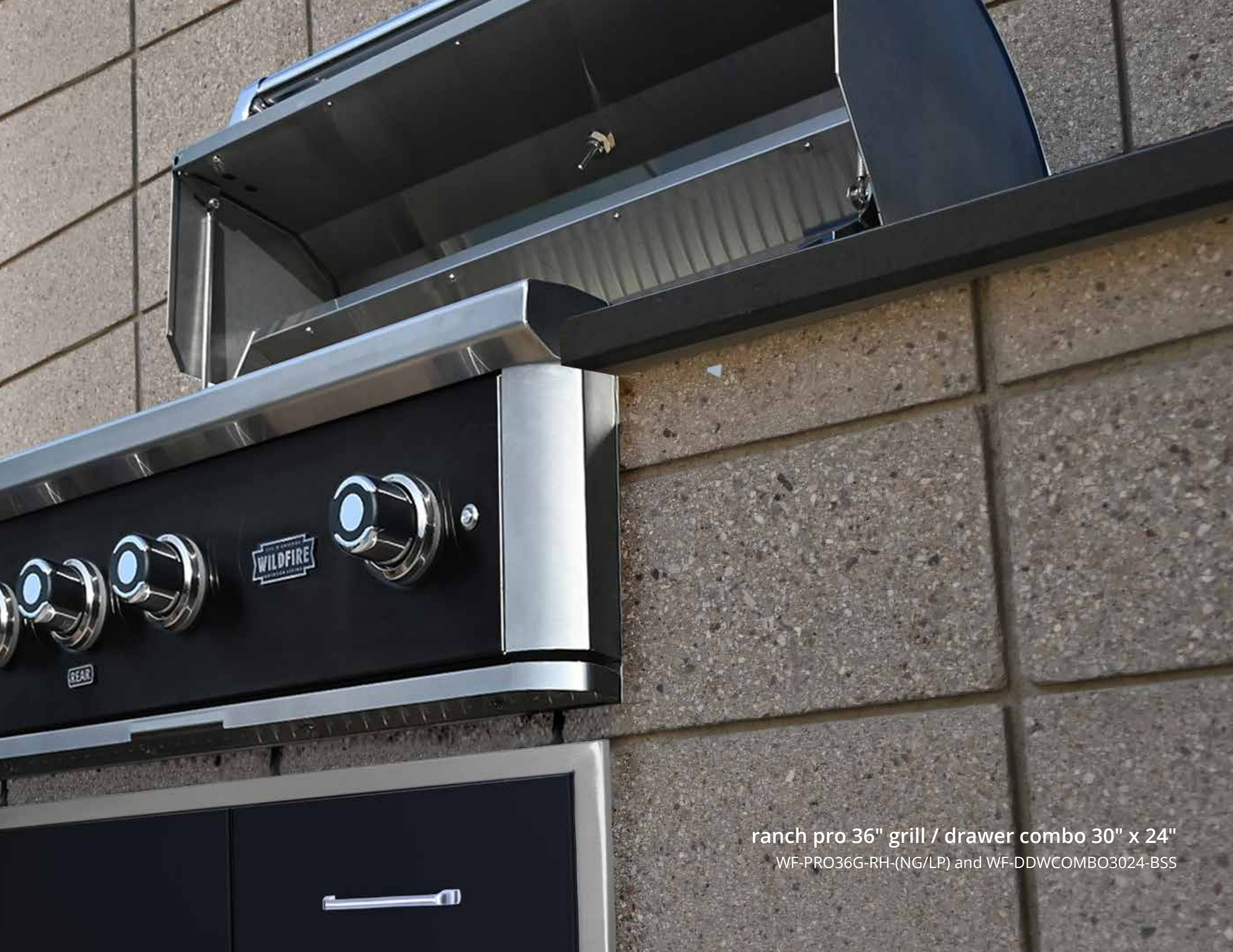
ranch pro 36" grill / drawer combo 30" x 24" WF-PRO36G-RH-(NG/LP) and WF-DDWCOMBO3024-BSS