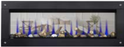
CLEARion Elite 50 Glass in see through mode