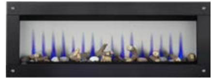
CLEARion Elite 50 Glass in opaque mode