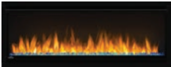
NEFL42CHS-1 - Slim