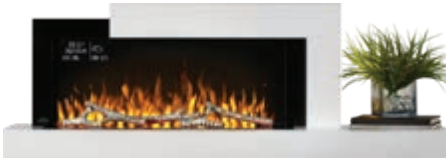
NEFP32-5019W-IOT - Cara Elite