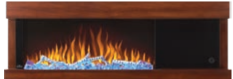
NEFP32-5320BW - Steinfeld