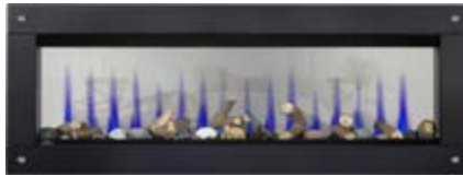
CLEARion Elite 50 Glass in semi-transparent mode