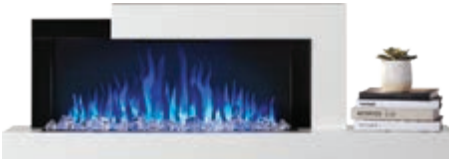
NEFP32-5019W - Cara