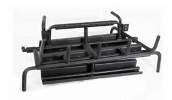
Available Sizes: 18", 24", 30", 36" and 42" Item # 3BRN-##