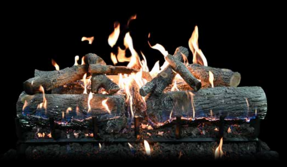
Lava Burner Series - GlowFire™ Logs AZ Weathered Oak Charred 36"