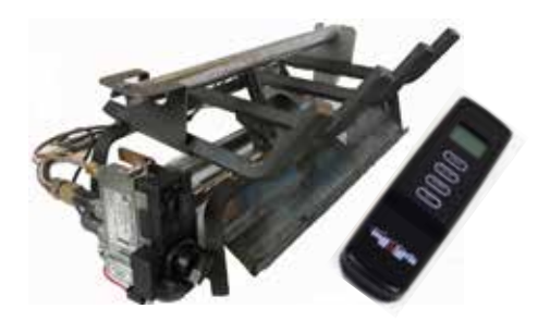
Variable Control with Burner & Remote