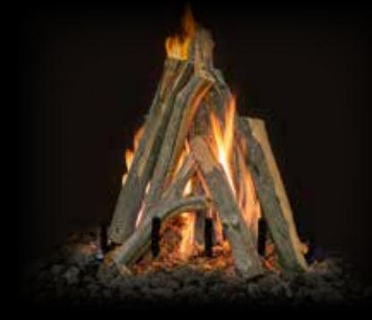
Kiva Arizona Juniper (AJ)