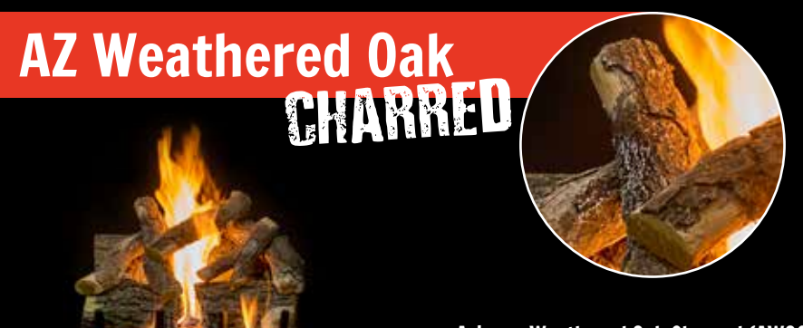
2-Burner Arizona Weathered Oak Charred 18"

This collection combines the detail and beauty from our native series and adds the extra dimension of an authentic charred look. Our log hunters hand-picked each of the logs and then burned the front logs right in half. Once burnt the logs are molded to capture the most realistic looking charred set on the market. Item # AWOC##LOGS