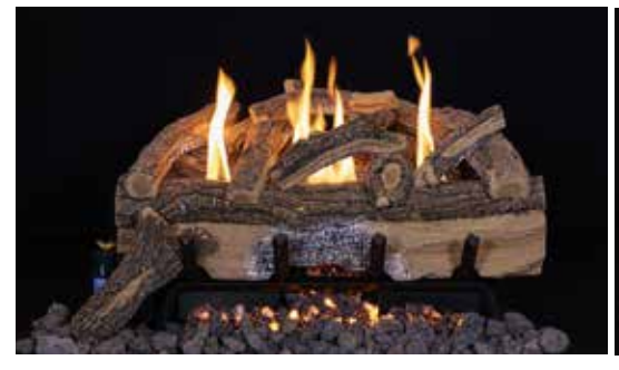
24" Split Oak Gas Logs