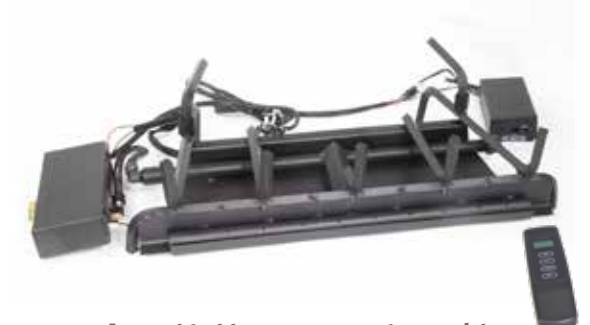
Assembled burner natural gas with battery electronic and remote system. 2BRN-##-**-MVKEI-GCRK