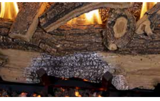
Realistic hand-painted charred logs