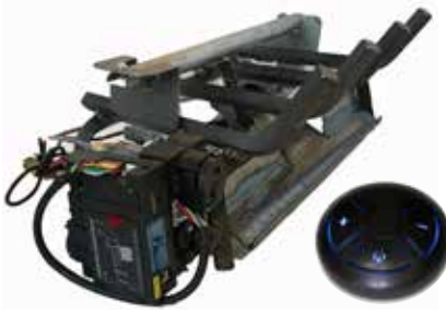
IPI Electric with Burner Puck Remote included with this Variable Electric model only.