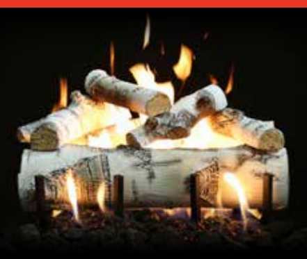
2-Burner Quaking Aspen 18"