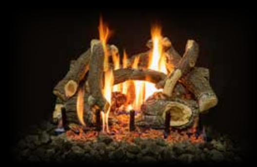
2-Burner Arizona Weathered Oak Charred 24"

Arizona Weathered Oak Charred (AWOC) Available in 18", 24", 30", 36" and 42". Front View and See-Through. Burner compatibility 2 and 3 burner.