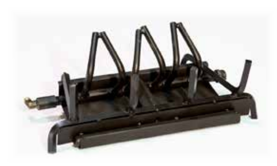
Available Sizes: 18 (12"), 24 (18") and 30 (21") Item # KIVABRN-##