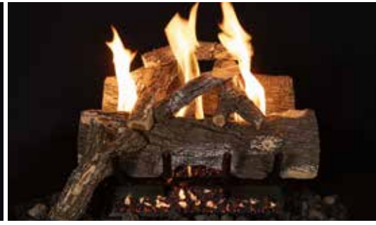
18" Weathered Oak Gas Logs