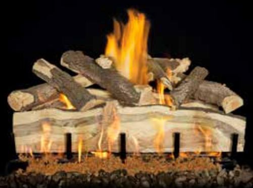
2-Burner Blue Pine Split 30"