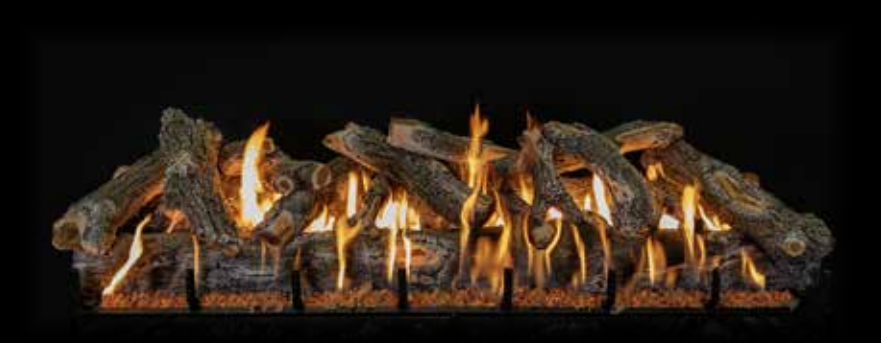
2-Burner Arizona Weathered Oak 60" Also available in 48"