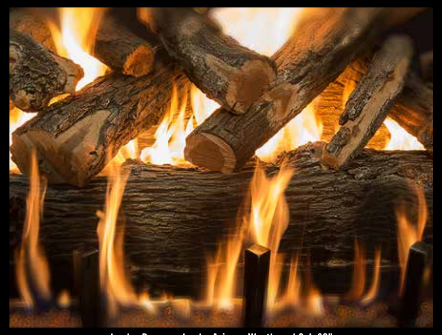
Jumbo-Burner - Jumbo Arizona Weathered Oak 60"