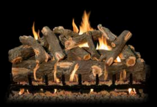
3-Burner Arizona Weathered Oak 42"