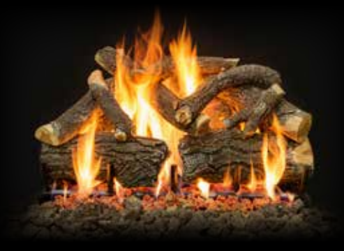
2-Burner Arizona Weathered Oak Charred 30"