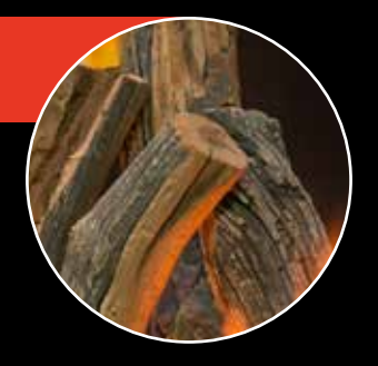
KIVA (KIVALOGS) Available in 18", 24" and 30". Front View only. Burner compatibility Kiva burner.