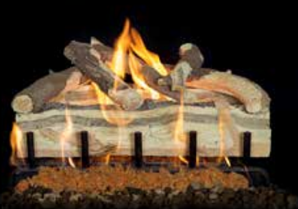
2-Burner Blue Pine Split 24"