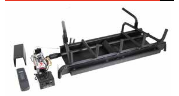
Assembled burner natural gas with millivolt and remote system. 2BRN-##-**-MVK-GCRK