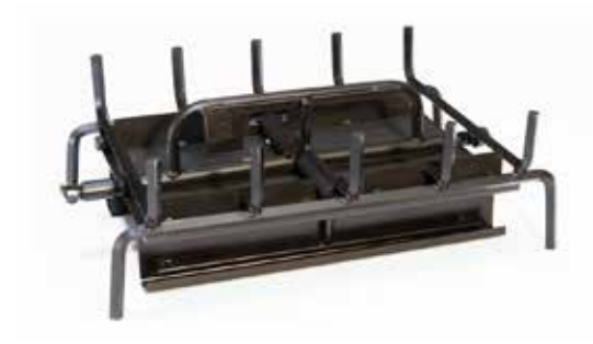
Available Sizes: 18", 21", 24", 30", 36" and 42" Item # 3BRN-ST##