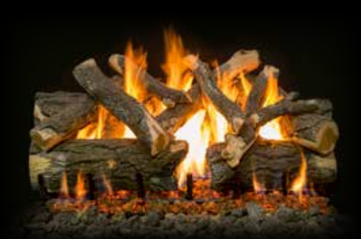
3-Burner Arizona Weathered Oak Charred 36"