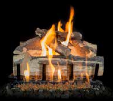
2-Burner Blue Pine Split 18"