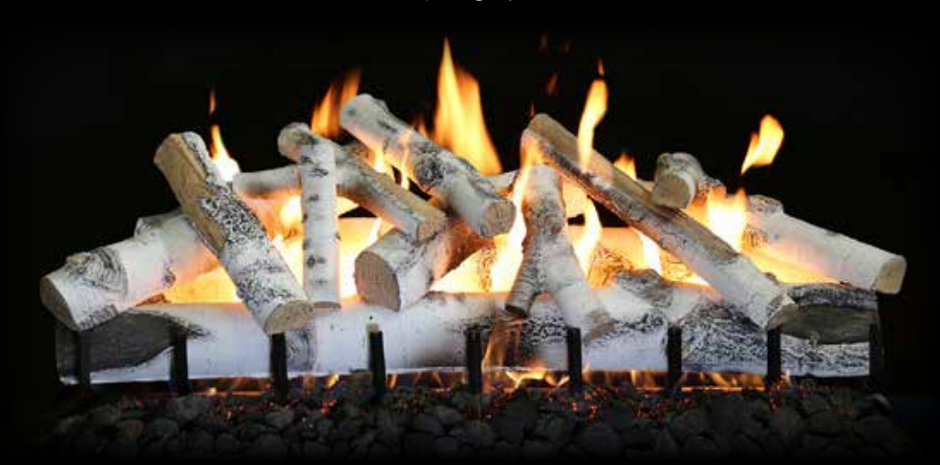
2-Burner Quaking Aspen 42"