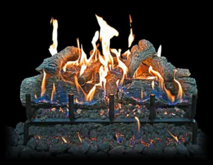
Lava Burner Series - GlowFire™ Logs AZ Weathered Oak Charred 24"