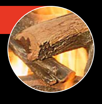
Arizona Juniper (AJ) Available in 18", 21", 24", 30", 36" and 42". Burner compatibility 2 and 3 burner.