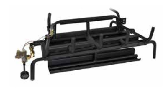
Assembled burner natural gas with safety pilot system. 3BRN-##-**-SP