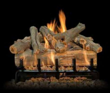
3-Burner Arizona Juniper 24"