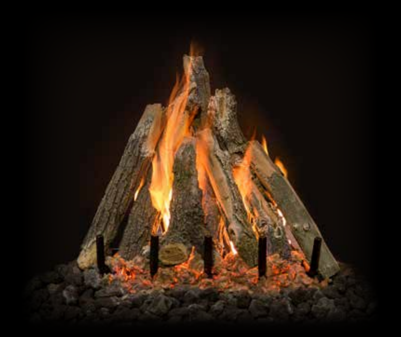
Kiva Arizona Weathered Oak (AWO)

A Southwest favorite, the Kiva Collection has been found to be a very versatile burner system. Designed to fit Adobelite Kiva fireplaces, burners 18", 24" and 30" have actual overall widths of 12", 18" and 21". With an overall depth of 9" this burner packs a punch for its small stature. Log options available are the Arizona Weathered Oak or the Arizona Juniper. Item # AWO-KIVALOGS Item # AJ-KIVALOGS