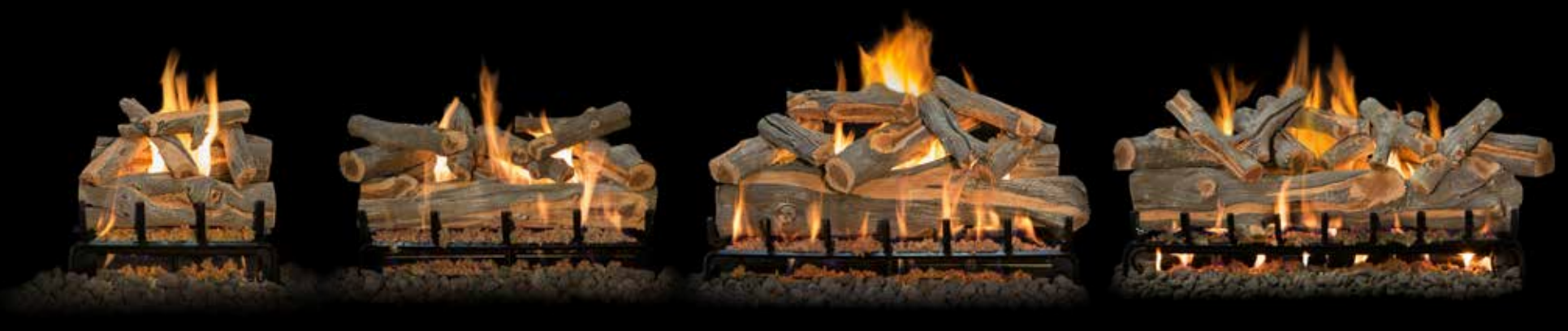
3-Burner Arizona Juniper 18"