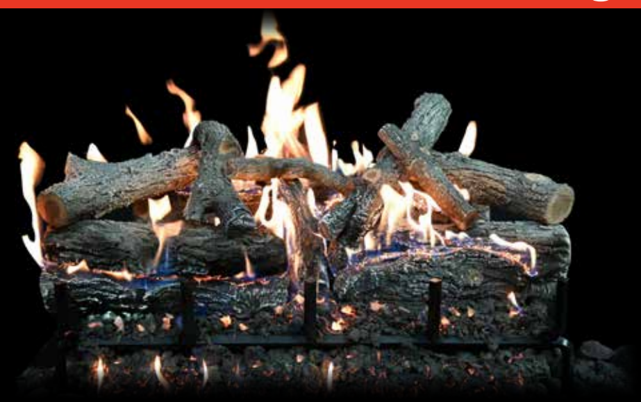
Lava Burner Series - GlowFire™ Logs AZ Weathered Oak Charred 30"