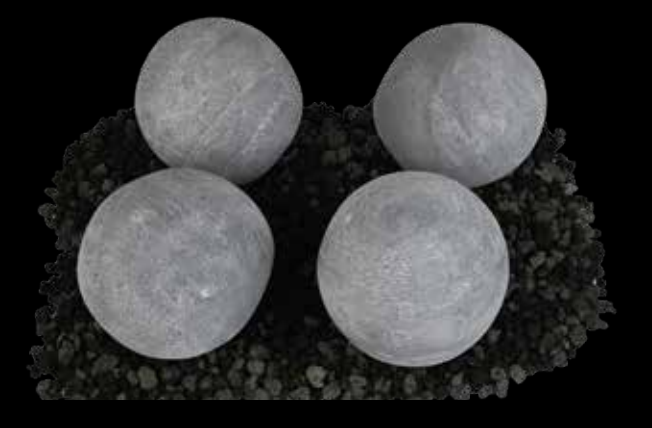
6" Cannonballs - Gray shown