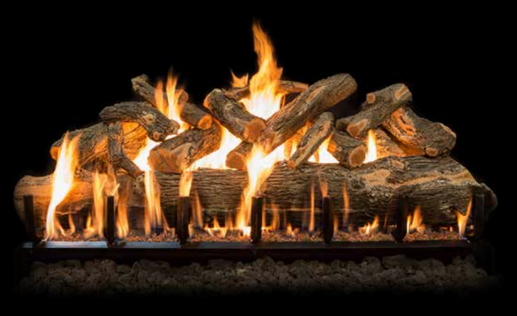
Jumbo-Burner - Jumbo Arizona Weathered Oak 60"