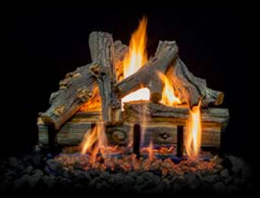
2-Burner Arizona Juniper 21"