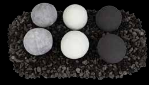
4" Cannonballs - Gray - White - Black