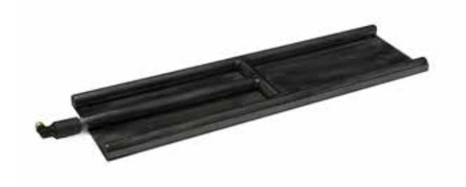
Available Sizes: 18"- 60" Item # GLASSBRN-##/12-H or GLASSBRN-##/14-H