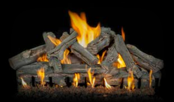
2-Burner Arizona Western Driftwood 42"