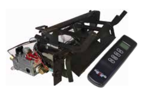
Standard Millivolt with Burner & Remote