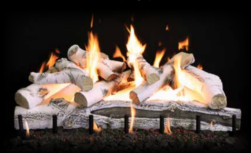
2-Burner Quaking Aspen 36"