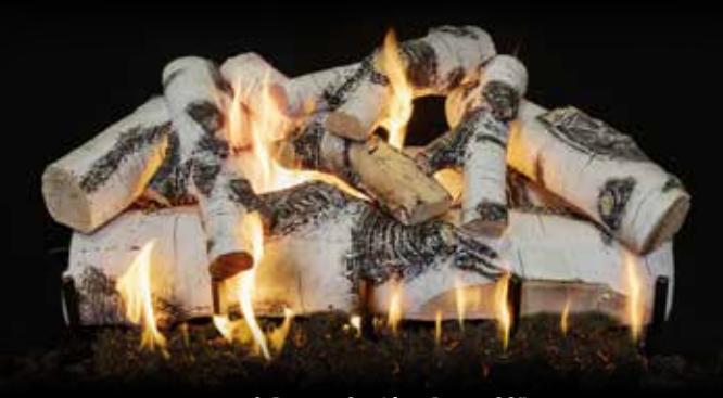
2-Burner Quaking Aspen 30"