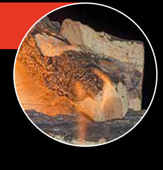
Blue Pine Split (BPS) Available in 18", 24" and 30". Front View only. Burner compatibility 2 and 3 burner.