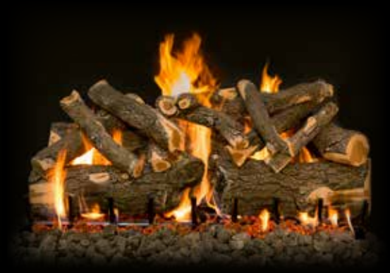
3-Burner Arizona Weathered Oak Charred 42"