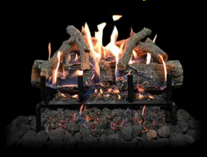
Lava Burner Series - GlowFire™ Logs AZ Weathered Oak Charred 18"