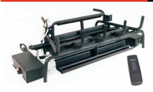
Assembled burner propane with battery electronic and remote system. 3BRN-##-**-MVKEI-GCRK