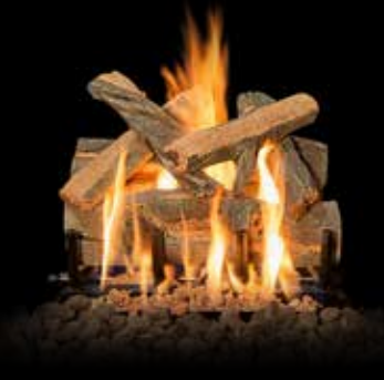
2-Burner Arizona Juniper 18"