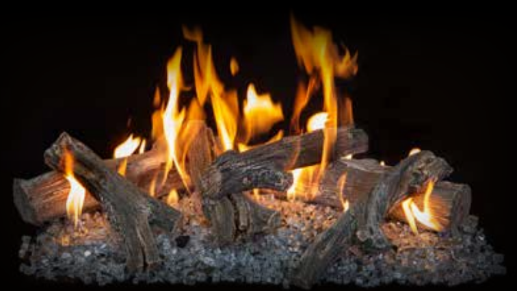
Glass Burner with 24" Driftwood Logs

Linear Western Driftwood log set adds a transitional dimension to a linear fireplace. These uniquely crafted logs spread across the fireplace giving a wood pile effect. Available in Linear Lengths 24" - 120" Item # WD-LINEAR-##LOGS