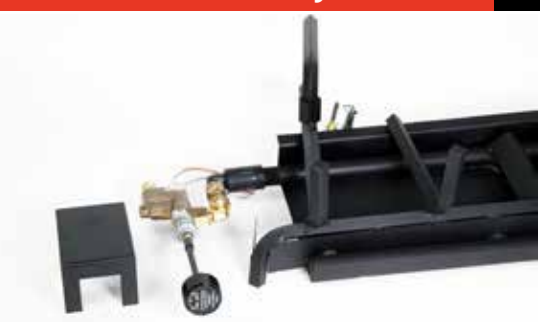
Assembled burner natural gas with safety pilot system. 2BRN-##-**-SP