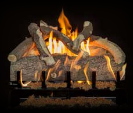
3-Burner Blue Pine Split 24"