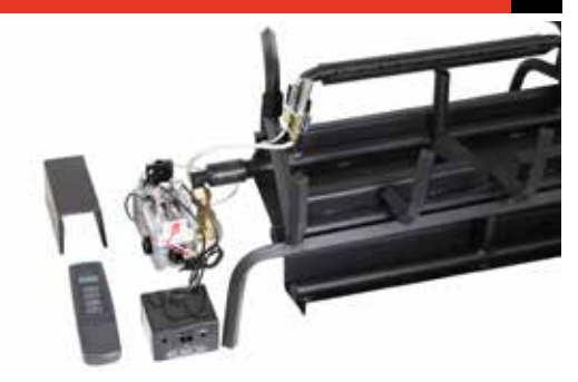
Assembled burner natural gas with millivolt and remote system. 3BRN-##-**-MVK-GCRK