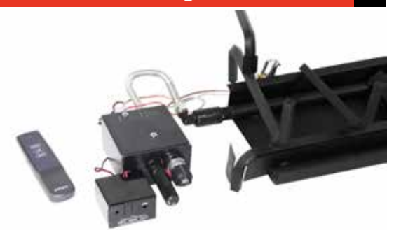
Assembled burner natural gas with modulating millivolt and remote system. 2BRN-##-**-MMVR