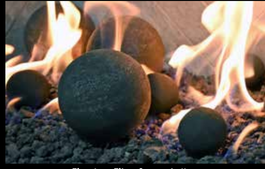
Fireplace Fiber Cannonballs