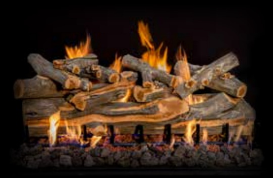
2-Burner Arizona Juniper 42"