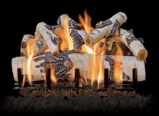
2-Burner Quaking Aspen 24"

Here is Grand Canyon Gas Logs' signature birch set. This traditional birch log set balances the cream whites with the scarred black bark from the winter snows. Item # ASPEN##LOGS