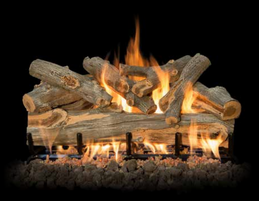
2-Burner Arizona Juniper 30"

Found in the washes and valleys of the Northern Arizona terrain, much of the character of the natural wood comes from the rainy springs and hot summers causing exotic cracking and wild twisting in the wood. Our log hunters hiked the washes hand-picking each of the logs that make up the Arizona Juniper sets. Take notice of the detail in each one of the logs that feature deep cracking, pitting and natural wood decay only perfected by Mother Nature.