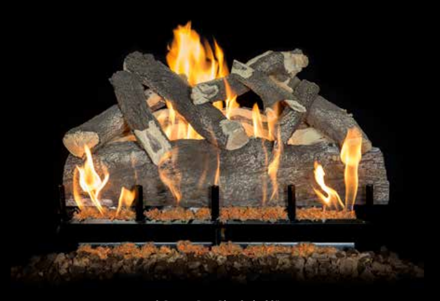
3-Burner Blue Pine Split 30"

These logs were found in the bark beetle ravaged forest of Northern Arizona. The infestation of beetles left behind acres upon acres of downed trees, however it created unbelievable wood character only captured in the Blue Pine Split log collection. The deep grain pattern and gray highlights make this look like the wood was split right in half in your fireplace. Don't like the split side, reverse the log to showcase the fantastic Alligator bark.