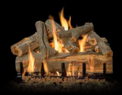
2-Burner Arizona Juniper 24"