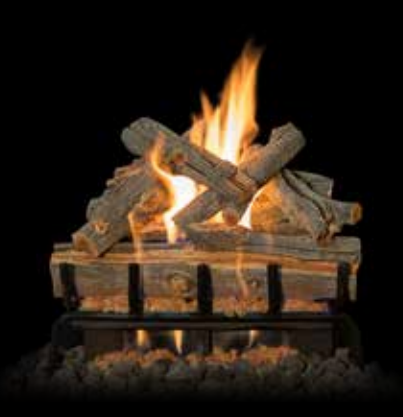
3-Burner Arizona Juniper 21"