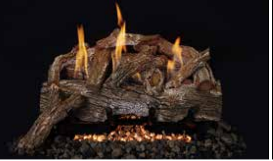
24" Red Oak Gas Logs