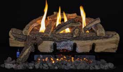
30" Split Oak Gas Logs