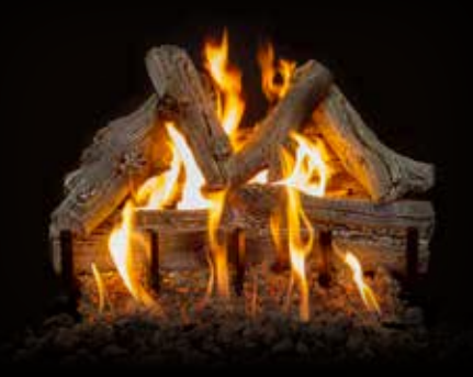
2-Burner Arizona Western Driftwood 21"