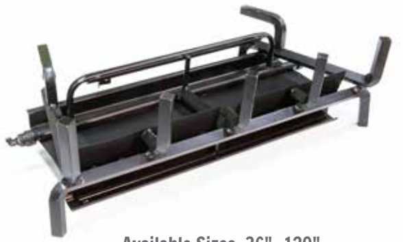
Available Sizes: 36"- 120" Jumbo = 21" Depth or Jumbo Slimline = 18" Depth Item # JUMBOBRNR-## Item # JUMBOSLIMBRNR-##