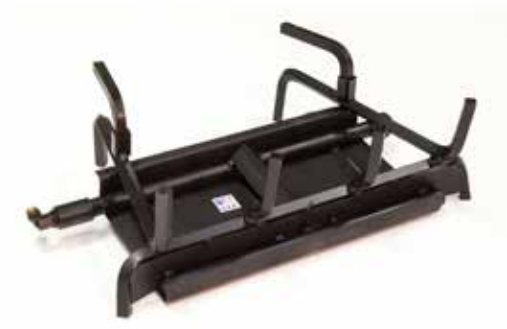
Available Sizes: 18", 21", 24", 30", 36", 42", *48" and *60" Item # 2BRN-##