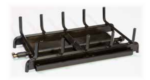
Available Sizes: 18", 21", 24", 30", 36", 42", 48" and 60" Item # 2BRN-ST##