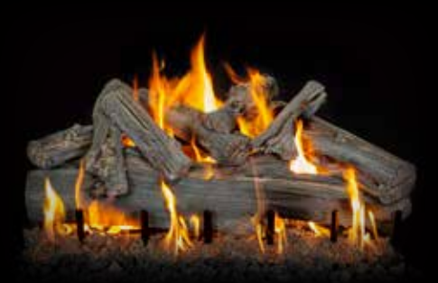
2-Burner Arizona Western Driftwood 36"