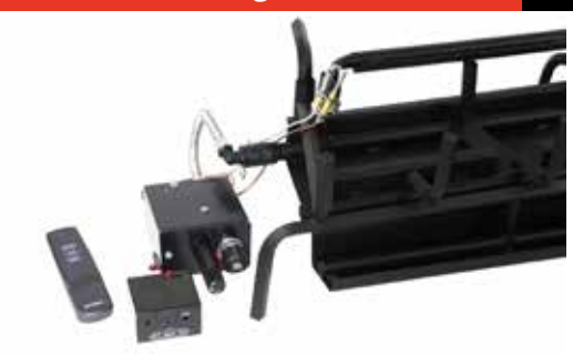
Assembled burner natural gas with modulating millivolt and remote system. 3BRN-##-**-MMVR