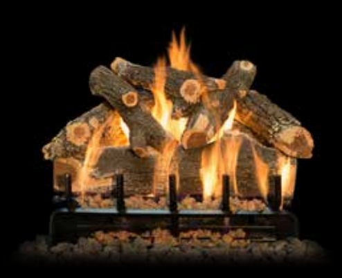
3-Burner Arizona Weathered Oak 24"