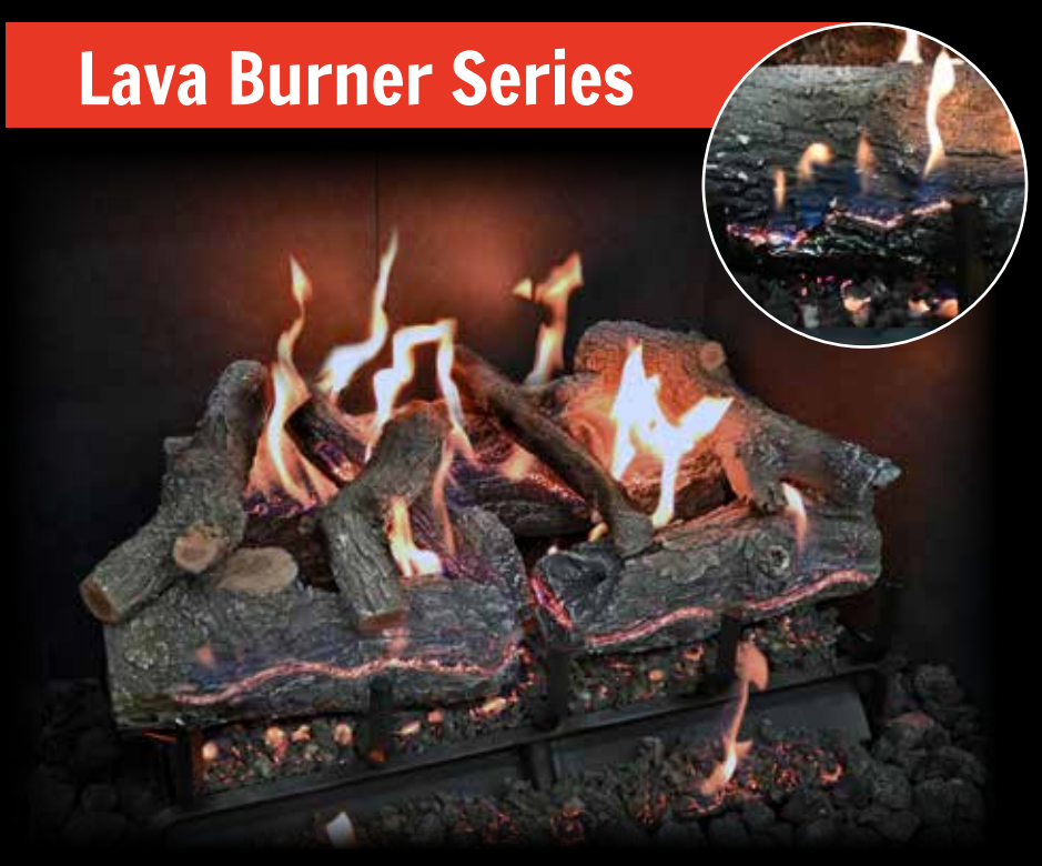
Lava Burner Series - GlowFire™ Logs AZ Weathered Oak Charred 24"

Available in 4 convenient sizes, gas specific construction, and available with either on/off or variable flame electronic controls. The Lava burner series and GlowFire™ log technology has created a platform for endless log styles and future configuration development.