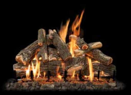
2-Burner Arizona Weathered Oak 36"