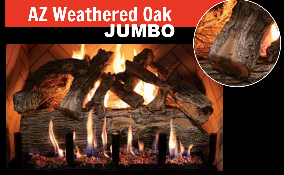
Jumbo-Burner - Jumbo Arizona Weathered Oak 36"

Our Jumbo Series matches our massive Jumbo burners with our hefty Jumbo Arizona Weathered Oak Logs. The 1" tines on the burner are a perfect complement to the 12" diameter of the Jumbo Arizona Weathered Oak front log. Big tines and big logs are not all this collection has to offer as massive flames are the final part of this 3 headed beast. Available in sizes 24" - 120" front view and see-through. Jumbo burners have a depth of 21" and the Jumbo Slimline burners are 18" deep. Item # JUMBOAWO##LOGS