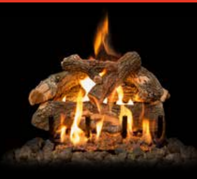
2-Burner Arizona Weathered Oak 18"