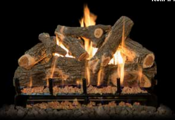
3-Burner Arizona Weathered Oak 30"

These logs were found in the mountains of the Northern Arizona forest. In fact, all of the logs that make up this collection were gathered from one tree that was hit by lightning more than 40 years ago. The effects of the lightning strike created bulges, twisting and cracking in the wood which are unique to our Arizona Weathered Oak Collection. Item # AWO##LOGS