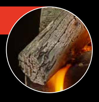
Arizona Western Driftwood (WD) Available in 18", 21", 24", 30", 36" and 42". Front View and See-Through. Burner compatibility 2 and 3 burner.