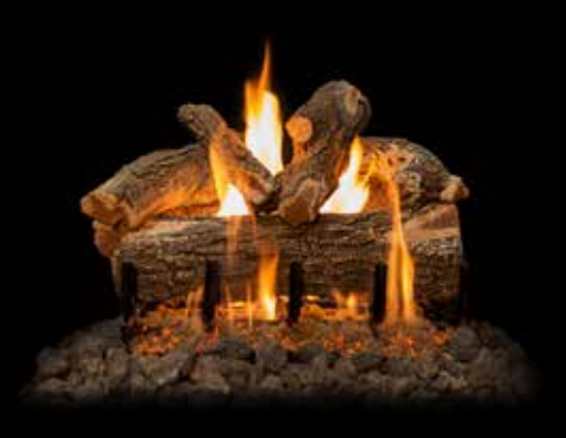
2-Burner Arizona Weathered Oak 21"