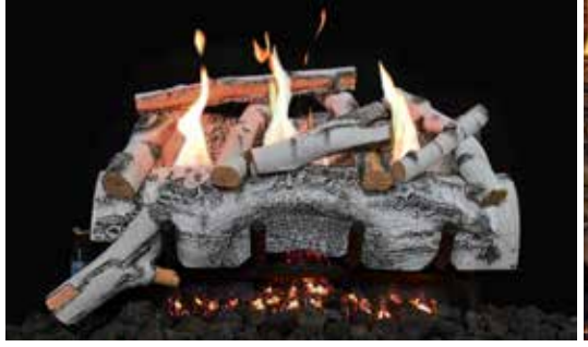
NEW 24" Aspen Birch Gas Logs