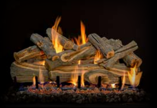
2-Burner Arizona Juniper 36"