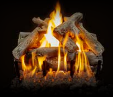
2-Burner Arizona Western Driftwood 18"