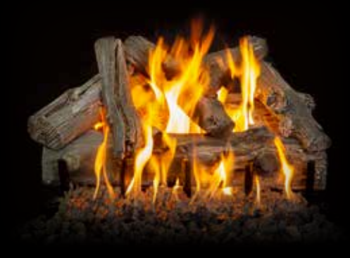
2-Burner Arizona Western Driftwood 24"