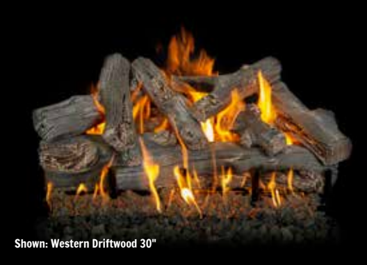
Western Driftwood (DRIFTW00D) available in 18", 21", 24", 30", 36" and 42". Burner compatibility 2 & 3 burner. Item- DRIFTW00D##LOGS