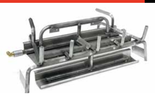
Available Sizes: 18", 21", 24", 30", 36" and 42" Front View & See-Through Item- 3BRN-##-SS