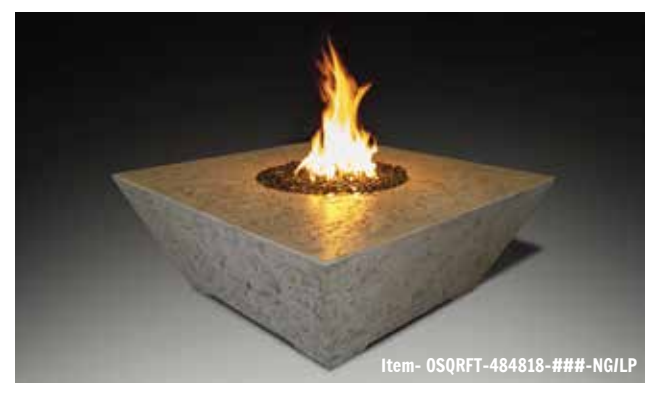
Square Fire Table

Dimensions: 48" x 48" x 18" (Shown in White)