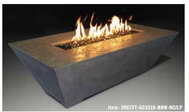
Linear Fire Table

Dimensions: 48" x 48" x 18" (Shown in Charcoal)