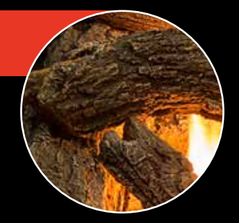
Jumbo Arizona Weathered Oak (JUMBOAWO) available in 36", 42", 48" and 60". Jumbo Slimline available 24" - 120". Only 21" deep burners. Item-JUMBOAWO##LOGS