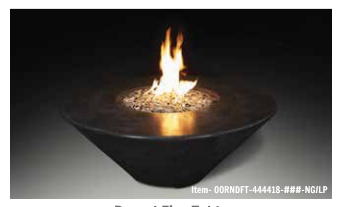
Round Fire Table

Dimensions: 48" x 48" x 18" (Shown in White)