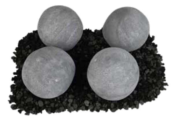
6" Cannon Balls Box of 4 - Black, Dark Gray or Silver Item- CB6-4-##