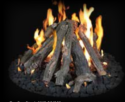
Shown: Tee Pee Stack AWO 30/36"