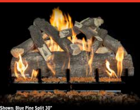
Blue Pine Split (BPS) available in 18", 24" and 30". Burner compatibility 2 & 3