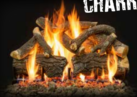
Shown: Arizona Weathered Oak Charred 30"