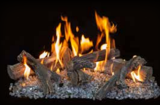
Shown: Linear Western Driftwood 24"