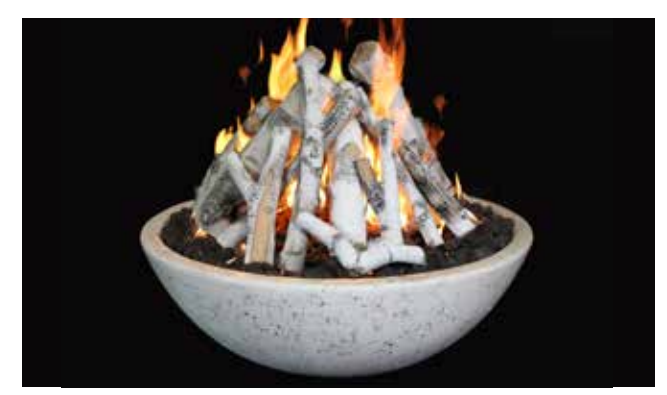
Aspen Tee Pee Log Set w/Lava Rock* (Shown in White)