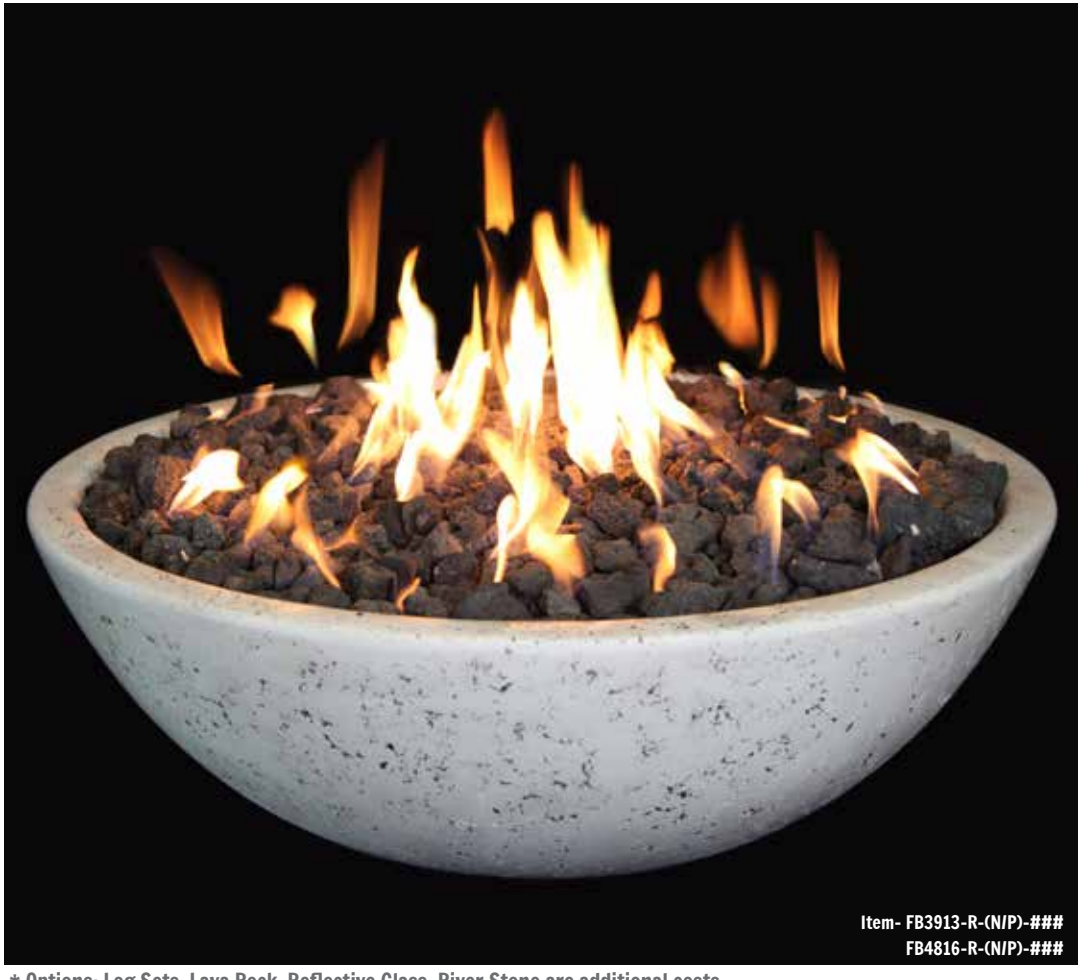
* Options: Log Sets, Lava Rock, Reflective Glass, River Stone are additional costs.