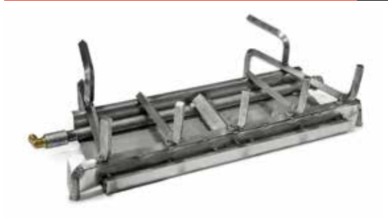
Available Sizes: 18", 21", 24", 30", 36", 42", 48"* and 60"* * Height of 3-Burner

Front View & See-Through Item- 2BRN-##-SS