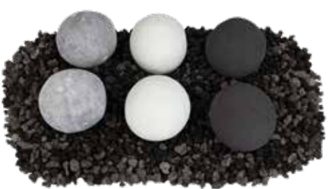
4" Cannon Balls Box of 8 Black, Dark Gray or Silver Item- CB4-8-##