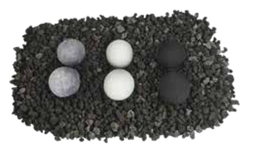
2" Cannon Balls Box of 12 Black, Dark Gray or Silver Item- CB2-12-##