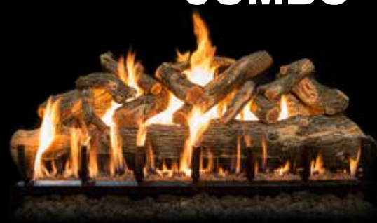
Shown: Jumbo Arizona Weathered Oak 48"