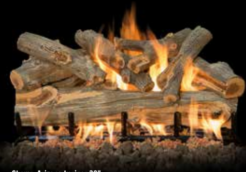
Shown: Arizona Juniper 30'