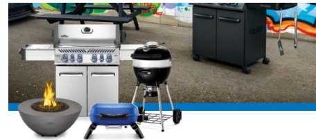
Labor Day Promotion (US Only) August 22 – September 12, 2024

Assets: Flyer with Qualifying Grill List