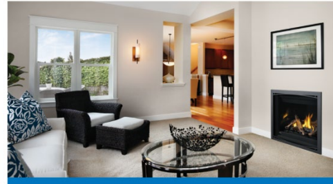
Altitude Promotion August 9 - December 31, 2024

DOCUMENTS NEEDED: Consumer Proof of purchase sales order must be shown during valid promotional dates. Please email to msmith@afdistributors.com